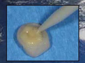
DUO-LINK UNIVERSAL cement dispensed into crown