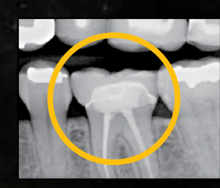
Easily identifiable on a radiograph